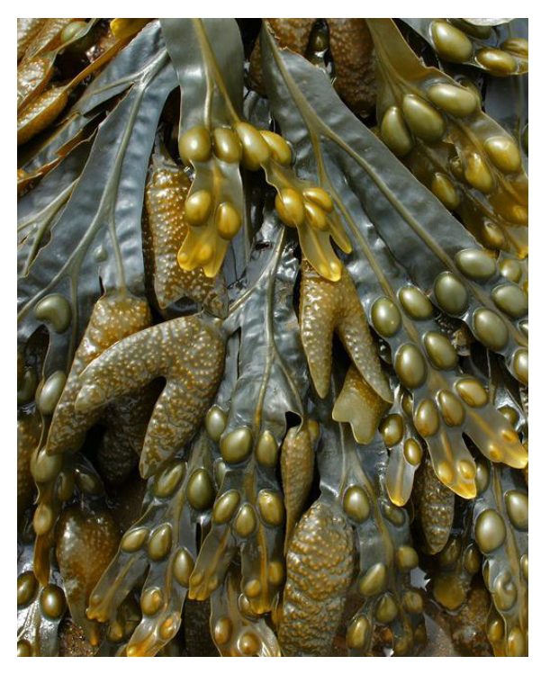
Founder Jay Harman noticed as a child that seaweed, among other objects in nature, tended to form the same curviture to allow water to pass. As an adult, he studied the mathematics behind this phenomenon to apply it to PAX's technologies.

Traditional fans, pumps, and propellers—collectively known as rotational equipment—consist of planar surfaces, or surfaces with simple curvature in only one axis. They use these geometries to generate centrifugal forces—forces moving outward from the center of rotation. These forces then generate turbulence that causes the gas or fluid to move or mix. Rotational equipment design has changed only incrementally since the Egyptians and Archimedes developed their solutions, both over 4,000 years ago. Gradual modification and tinkering have produced modern designs that are not much different from their ancient predecessors. Fundamentally, these technologies remain inefficient.