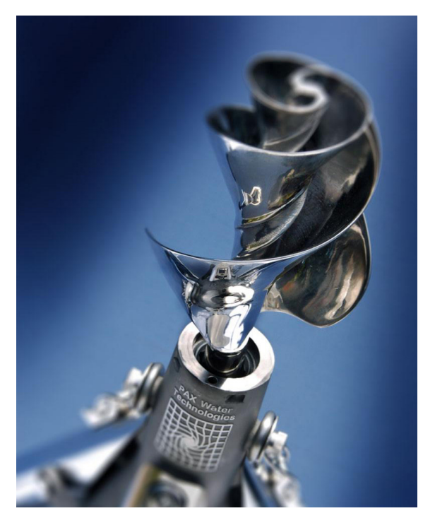
The Lily Impeller improves on conventional impeller technology by reducing drag. The result is that the device requires far less energy to operate than conventional water mixing technologies.

In 2004, PAX employees identified the new potable water regulations to limit disinfectants and require increased water quality as a major business opportunity. PAX Water Technologies was then founded in 2006 as a subsidiary of PAX Scientific. PAX Water is charged with developing and applying the PAX impeller technology for water and wastewater treatment applications. From 2005-2007, PAX Scientific had focused primarily on technology development, but had not fully realized commercial applications. Though they possessed the Lily Impeller, and the data to show that it offered tremendous improvements over other liquid impellers, PAX Scientific